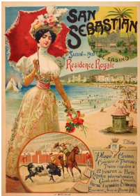
Gustave Hastoy San Sebastian, Spain, 1900 Colour lithography, 132,5 x 94,7 cm