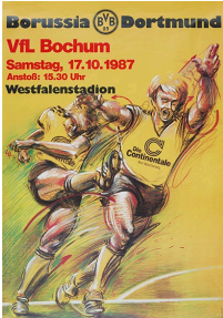
Andreas Slominski Borussia Dortmund – VfL Bochum, 1986–1989 , from the series Residences versus Birthplaces Offset printing, 84 x 59,4 cm © Andreas Slominski

ANDREAS SLOMINSKI Residences versus Birthplaces 15 March – 7. July 2024