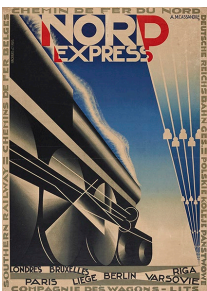
A.M. Cassandre Chemin de Fer du Nord / North Express , France, 1927 Colour lithography, 105 x 75,2 cm

PHOTOGRAPHY MASTERS Folkwang University of the Arts 9 February – 26 May 2024