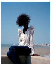
Viviane Sassen Kine, 2011 From the series Parasomnia

GROW IT, SHOW IT! A look at hair from Diane Arbus to TikTok 13 September 2024 – 12 January 2025